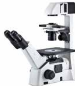
AE30 / 31